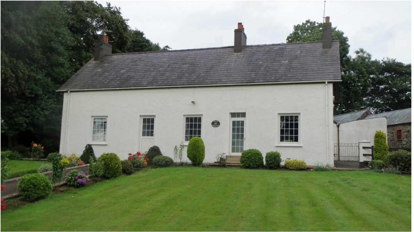
ROSEBANK Farm (2014) – Now a dairy farm. Corner Fenagh Road & Tullygrawley Road, north of Ballymena.