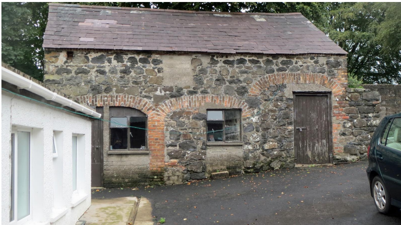
Portion of the original ROSEBANK farm buildings now to the rear of the current farm cottage, seen at the left.